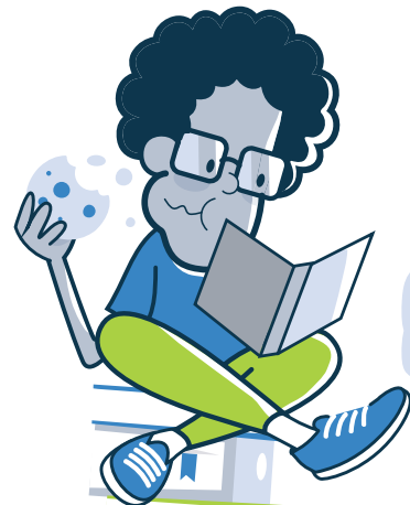
APPROACH TO LEARNING